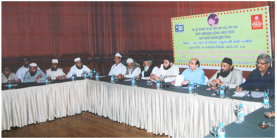
Meeting with Ulemas, Lucknow.

Addressing the gathering, the State Health Minister suggested that Rotary could organise immunisation booths and camps during Kumbh Mela which is a religious gathering along the banks of convergence of three holy rivers. Stressing on the important role played by Rotary in the implementation of the polio eradication campaign, the Minister asked Rotarians to look into the issue of refusal by population in urban cities like Agra, Varanasi and Kanpur, where